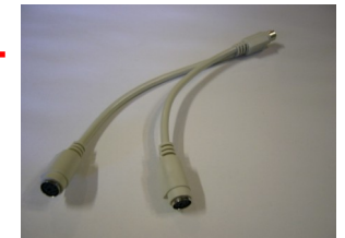
Keyboard and mouse splitter cable