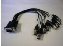
Cameras 1-8. 15 pin D-Type input/output breakout*