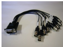
Cameras 9-16. 15 PIN D-Type input/output breakout*